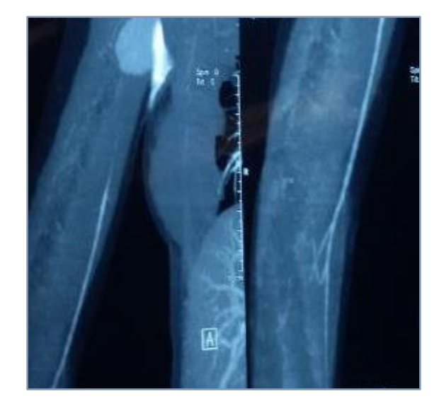
Fig. 1: CT Angio Film Showing Pseudoaneurysm Arising from Proximal Part of Right Brachial Artery with Poor Calibre Run off of Brachial Artery Distal to Lesion. The Ulnar and Radial Arteries Showed Normal Contrast Opacification through Collaterals

The decision "To revascularize or not" was a major issue as the limb was non-functional though viable. The presence of large matted lymph nodes encasing the axillary vessels posed a further challenge to vascular reconstruction. In view of normal capillary refill in the nail beds coupled with 100% oxygen saturation on digital pulse oximetry following occlusion of the brachial artery, we decided against graft reconstruction of the brachial artery. There was no clinical evidence of ischemia postoperatively. At 6 month follow-up, the limb remained viable but neurological recovery was poor. Histopathology revealed perivascular and transmural mixed lympho-histiocytic infiltrate in the brachial artery with luminal fibrin thrombus.